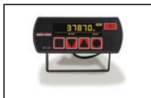
OB-350 Indicator PN 131219