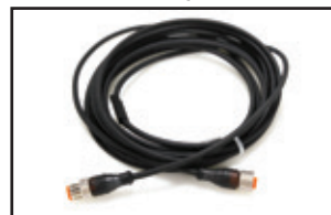
Homerun Cable PN 131228

Compatibility note: The Loadrunner dump truck kit has been designed for use on dual pin hinge pivot type dump bodies only. For dump truck body rear pivot assemblies using a single hinge bar, contact Rice Lake.