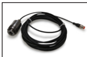
Hydraulic Transducer PN 131211