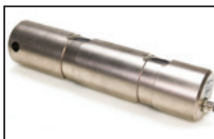
Dump Truck Load Pin PN 131207