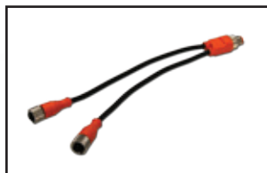
Y-Splitter Cable PN 131226