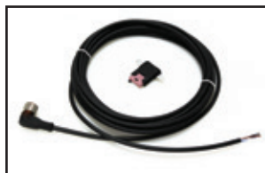
Power Cable PN 131221