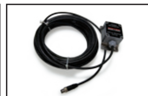
Onboard Inclinometer PN 131222