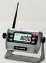
MSI-8000 HD RF Remote Display